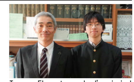
Toyama Elementary school's principal (left) and the writer (right)

Kaijo interacts with the students in Toyama Elementary School through an exchange meeting. Kaijo students show the children about