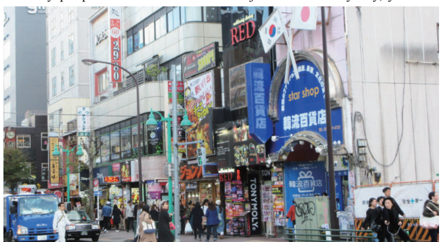
Many signboards written in Korean

in Okubo. According to a survey, 39% of people living in Okubo 1-chome and 2-chome are from foreign countries. In Shin-Okubo station, which is used by many Kaijo students every day, you can