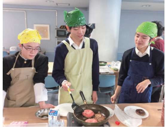
Students cook hamburgers in home economics