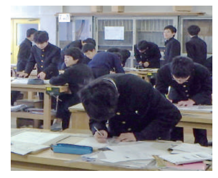
Students learn the method of drawing