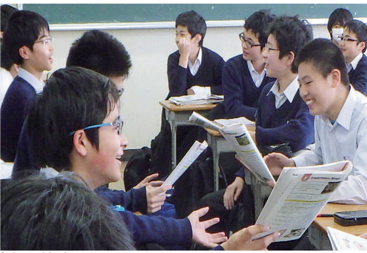
Students work in pairs