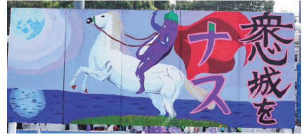
One of the best decore of the year

Every year each team draws a big painting called decore. Each team's theme color is used as the main color of the painting. Some of the teams