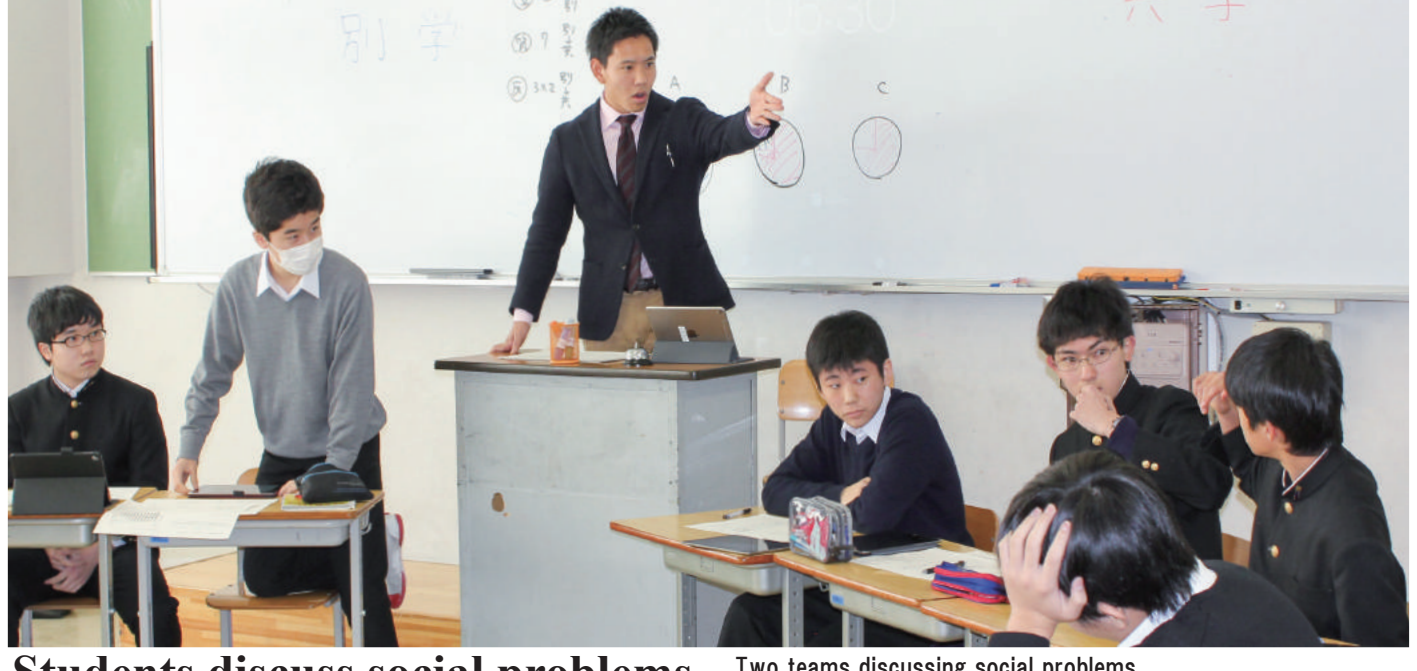
Students discuss social problems

In a social studies class, we have a debate several times on social problems that we choose as a topic by ourselves. To win the debate, we have to collect various information